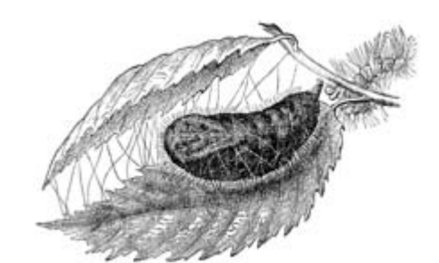
Gypsy moth pupa between two leaves