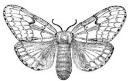
Gypsy moth female (life size)

The adult moths are not damaging because they do not feed and they only live long enough to mate and produce eggs. The brownish male moths fly during the day in search of females with which to mate. Whitish females do not fly, but attract males to them by means of a chemical "perfume," or pheromone. Egg masses deposited during mid- to late July will hatch the following spring, completing the life cycle.